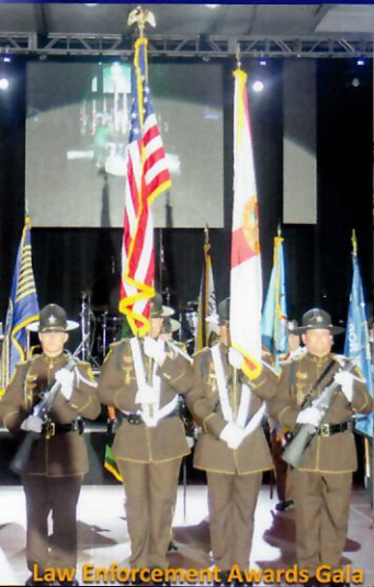
Law Enforcement Awards Gala

Created as a fun way to recognize the men and women of law enforcement, The South Florida PBA Law Enforcement Awards Gala celebrates current officers, remembers those who have fallen and stands in solidarity with the surviving family members they left behind.