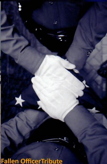
Fallen Officer Tribute