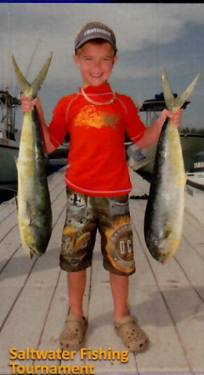
Saltwater Fishing Tournament